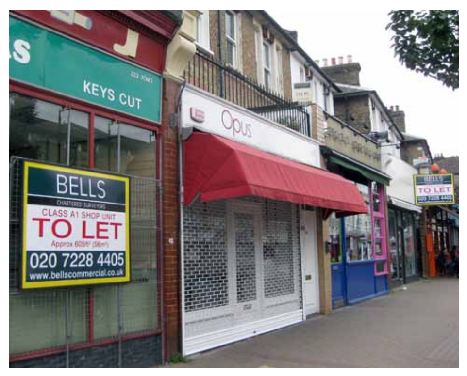
Small businesses in Battersea are struggling due to the rise in business rates

not been hit by massive increases in rates. On Battersea High Street, rates have not gone up at all. The table uses what are known as 'Zone A' rates: Zone A is the prime retail space in each shop: the area close to the window. Using Zone A eliminates vagaries due to different sizes or configurations.