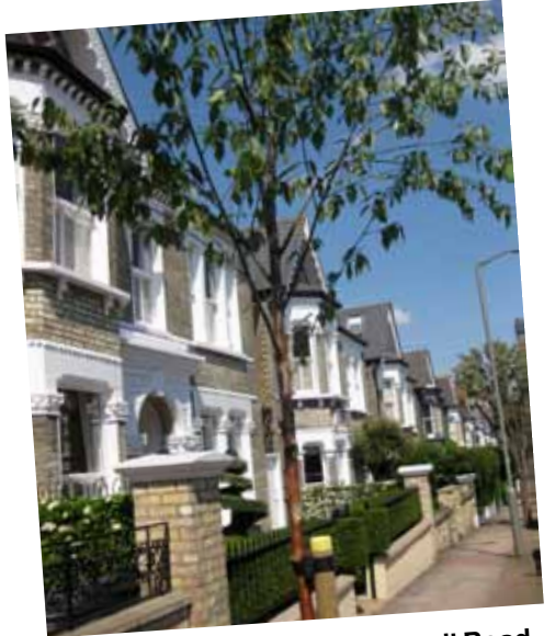
A Prunus schmittii in Honeywell Road

Andrew Wills explains how we can all help our street trees