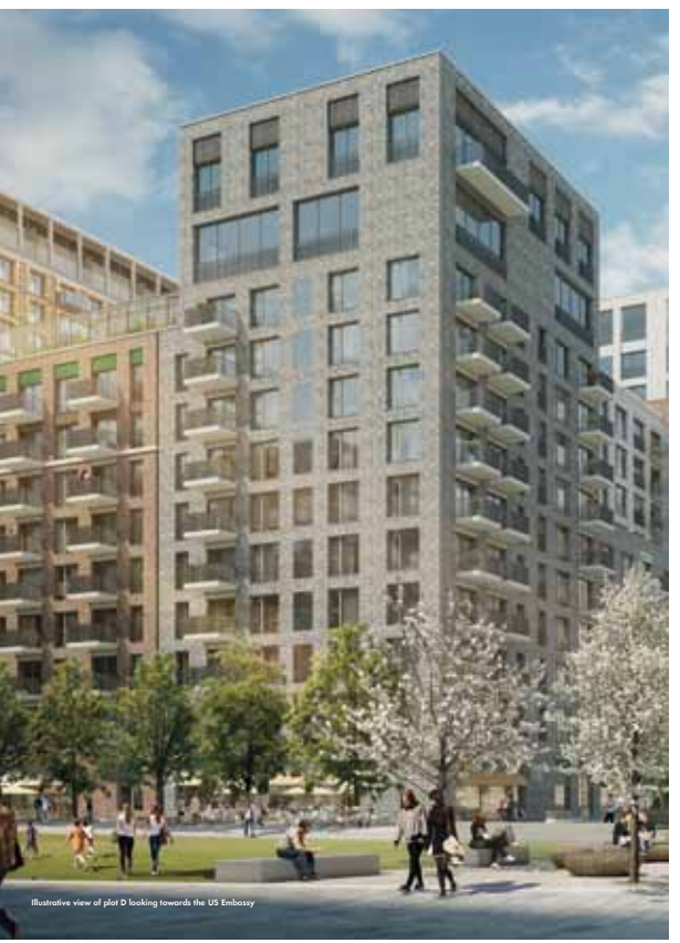
Artist's impression of the Royal Mail development, Nine Elms

Another aspect is the likely high cost of the rentals, with Discounted Market Rent (DMR) allowable at 80% of market rent, not including service