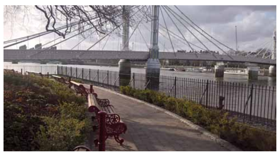
Albert Bridge from the Promontory Garden

What is lovely about the Promontory Garden is that it's a little pocket of peace that exists as an adjunct to the daily bustle of the park. It is beautifully designed and in keeping with its location, with a nod to the heritage of the park and the riverside's industrial past. The utilitarian bollards, slate shale mulching along the river edge and