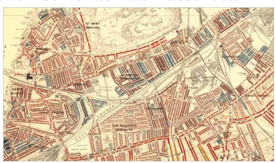
A section of Charles Booth's map showing very poor streets in Battersea (see key below)

A proliferation of new flats had also sprung up across the area causing a marked change to the urban landscape. Around Battersea Park there was a 'tremendous growth