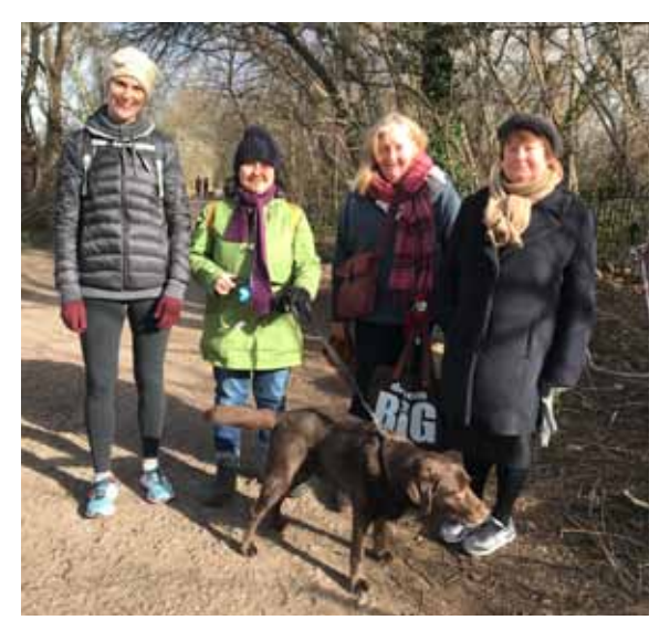
Members of the walking club and the book group enjoying their meetings