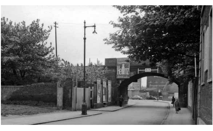
On the left in the picture, the site of Battersea Station on Battersea High Street, looking south

With the sharp increase in flats being built in the area, demand for the overground can only increase. The site is surrounded by a range of developments. New homes have been built on the site of the former Castle pub on Battersea High Street and over 200