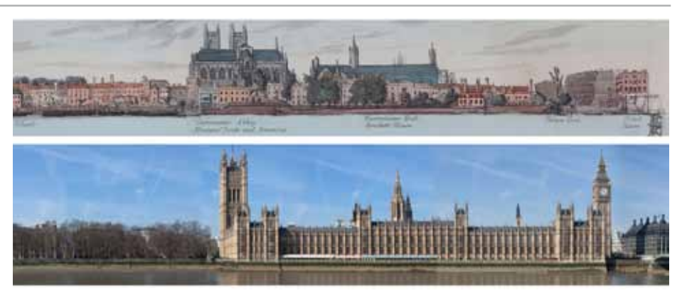
Westminster comparison, below City of London comparison

historians, to create a Guide to the Georgian Thames through London. After nearly three years, this work is almost complete.