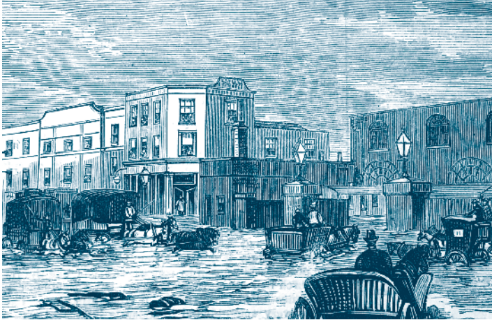
Nine Elms, 1877

persistent problem in lower-lying areas, adding to the misery of people living in overcrowded and unhealthy housing. Indeed endemic dampness was cited as a reason for the demolition of so much terraced housing in the slum clearances of the 1950s and 60s.