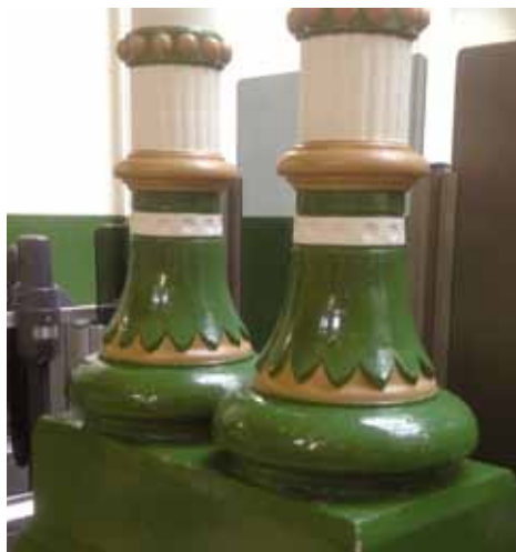
Embankment and Abbey Mills and Crossness pumping houses.