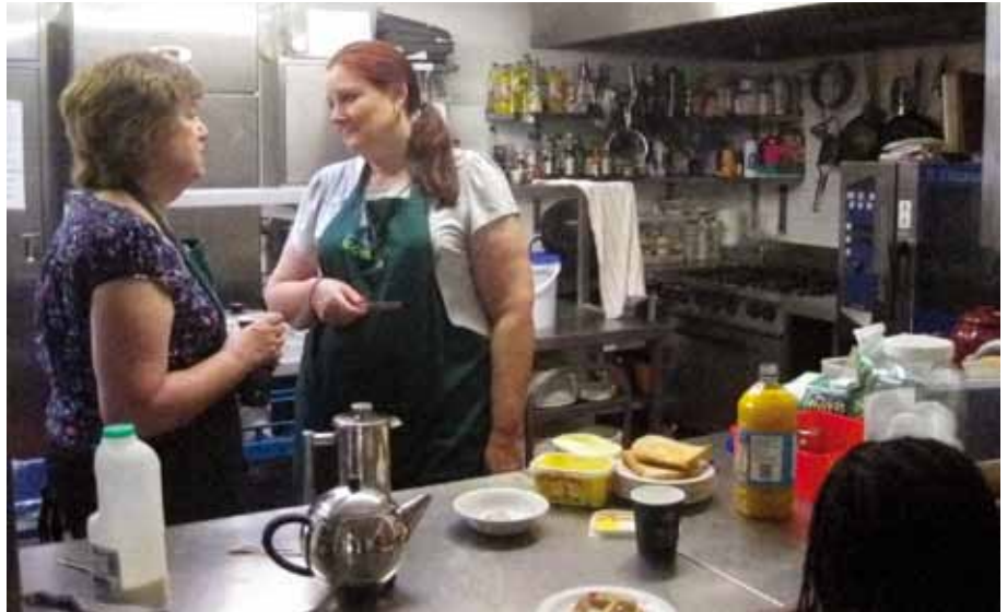
Volunteers at Wandsworth Foodbank, St Mark's Church, near Clapham Junction, prepare for the foodbank guests.

'The person who is given the voucher comes along to one of our centres. They have a cup of tea and a chat with one of our volunteers, who completes a 'shopping list' of items they need. The voucher tells us the nature of the crisis and the number of people in the household. We then put together shopping bags full of enough food for the family or individual for at least three days. People can bring up to three vouchers