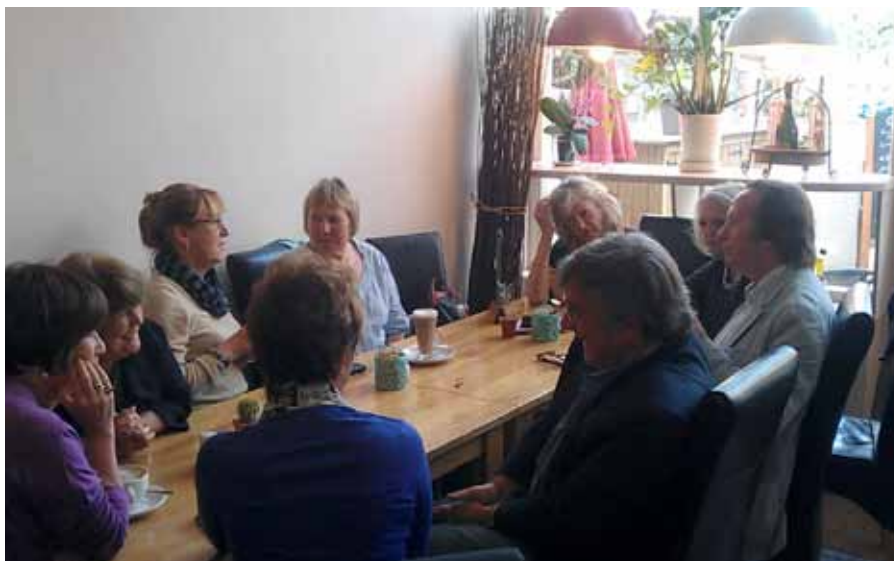
A lively discussion over coffee in the Café D'Élite. Social Plus meets here once a month.

This group gets between 10 and 20 members to our evening meetings and at the moment we hold them at the Battersea Mess and Music Hall, Lavender Gardens (roughly opposite the Lavender Hill Court and Police Station). This used to be the original Jongleurs Comedy Club and now is a trendy bar, restaurant and theatre. They offer our members a 25% discount off their wine prices and all draught real ale at £2.50 a pint.