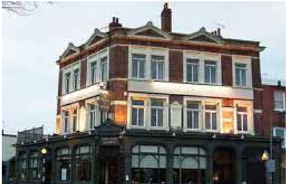
The Prince of Wales, Battersea Bridge Road

Plans were agreed for a development on this small site despite considerable concerns as to the impact on neighbours. Building has started on the approved scheme but surprisingly the developers are now applying to increase the height of the building in order to improve the accommodation and office space they offer (2013/3334).